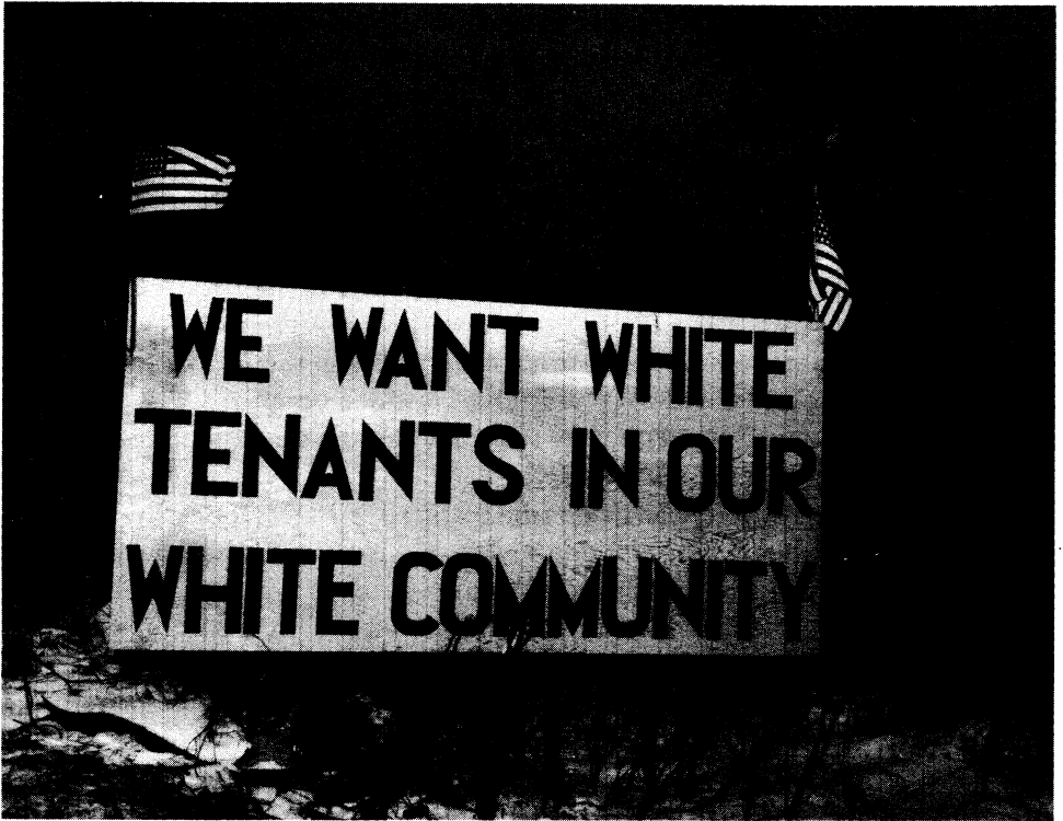
Sign protesting plans to open the Sojourner Truth Homes, a public housing project on Detroit's northeast side, to African Americans, February 1942.